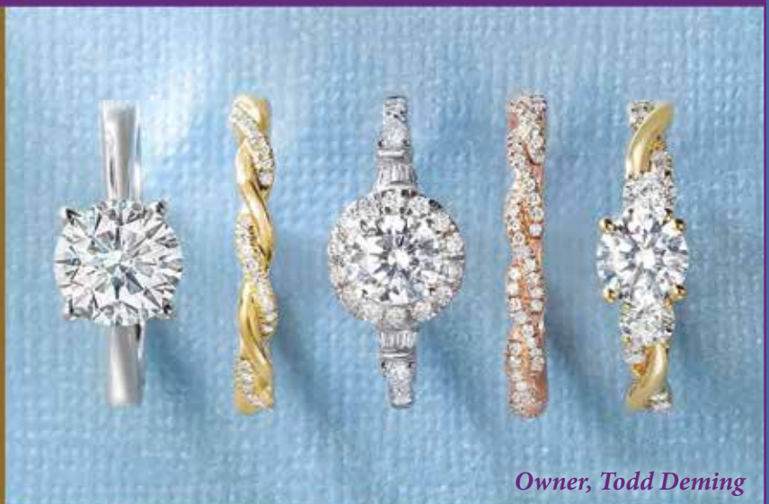
Owner, Todd Deming

We buy old Gold & Diamonds. Watch batteries & bands while you wait.